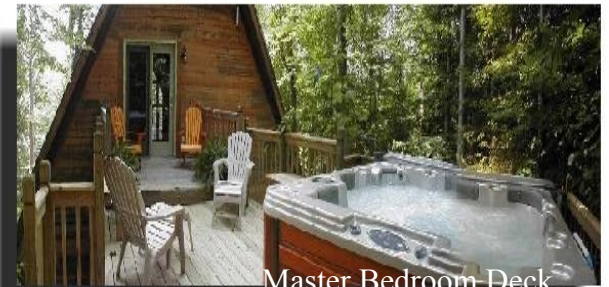
Master Bedroom Deck

If you choose to venture out of the Rustic Ridge retreat, within the scenic Hide-A-Way Hills community, over 30 miles of hilly graveled roads, winding around several lakes make for ideal walking trails. If you are daring, bring your bikes for ride around the community that will definitely test your strength and endurance. Dine at the Hide-A-Way Hills lodge. Between Lancaster and Logan (approximately 10 miles from each), the cabin is close to all Hocking Hills attractions, and just a few minutes from many areas that are less traveled, and even more beautiful. Go antiquing at the numerous shop in Lancaster and Logan, or take a canoe down the Hocking River. Whatever you decide to do, just remember that at the end of the day, the comfortable luxury of Rustic Ridge Retreat waits you..